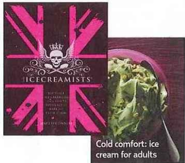
Cold comfort: ice cream for adults