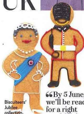
Biscuiteers' Jubilee collection, £6 each (biscuiteers.com)