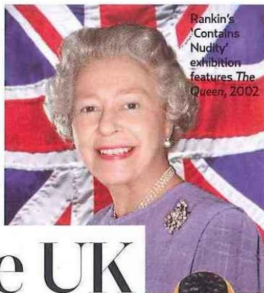
Rankin's 'Contains Nudity' exhibition features The Queen, 2002