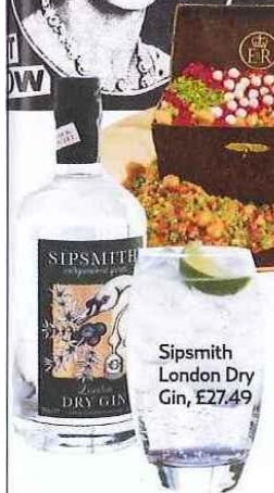
Sipsmith London Dry Gin, £27.49