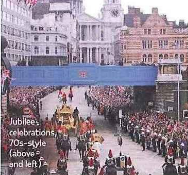
Jubilee celebrations, 70s-style (above and left)