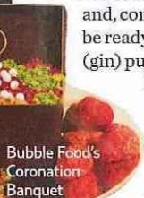
Bubble Food's Coronation Banquet