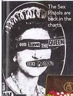
The Sex Pistols are back in the charts

“By 5 June, we'll be ready for a right royal (gin) punch-up”